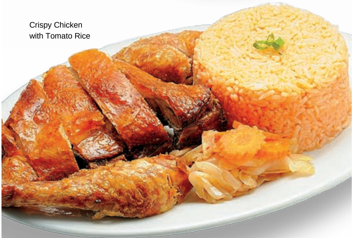
Crispy Chicken with Tomato Rice