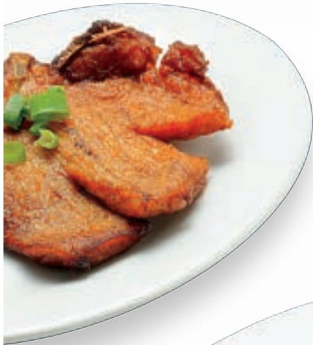
Pork Chop Only