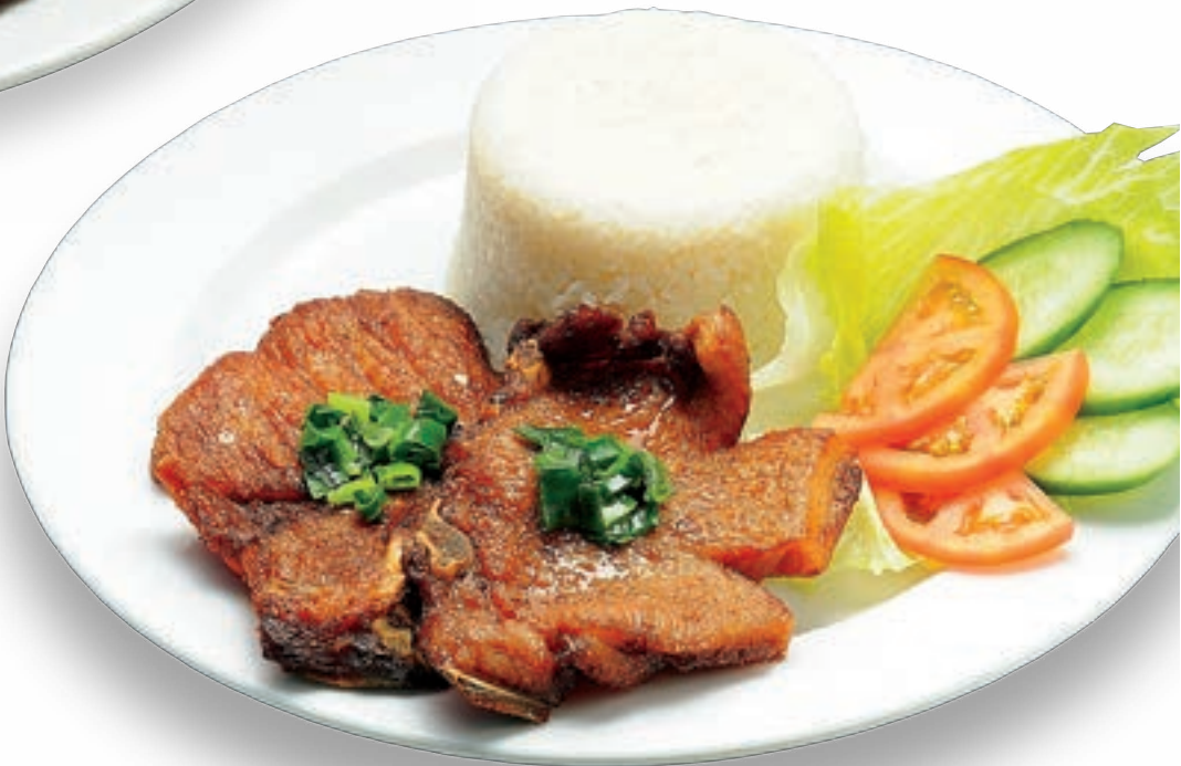
Pork Chops with Broken Rice