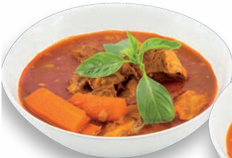
Spicy Beef Stew