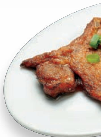
Deluxe Pork Chop with Broken Rice