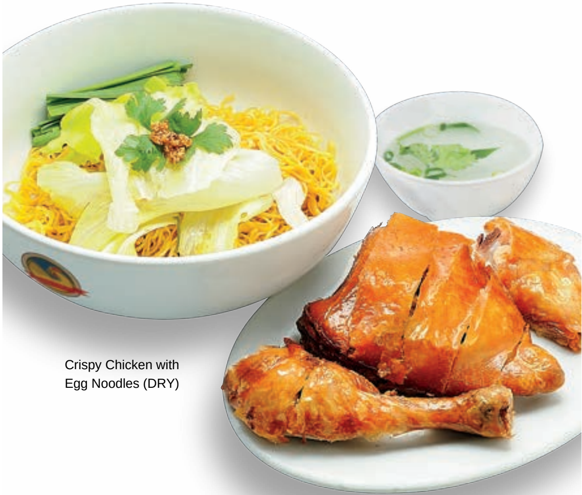
Crispy Chicken with Egg Noodles (DRY)