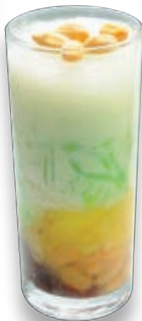
3 Colours Sweet