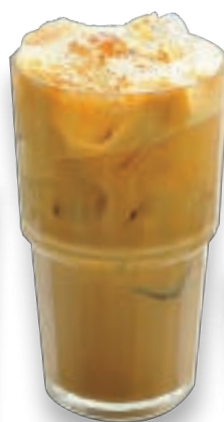
Ice White Coffee