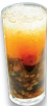
Longan and Lotus Seeds

Mixture of jackfruit, lychee, longan, palm seeds and pandan jelly in sugar syrup topped with coconut milk and shaved ice