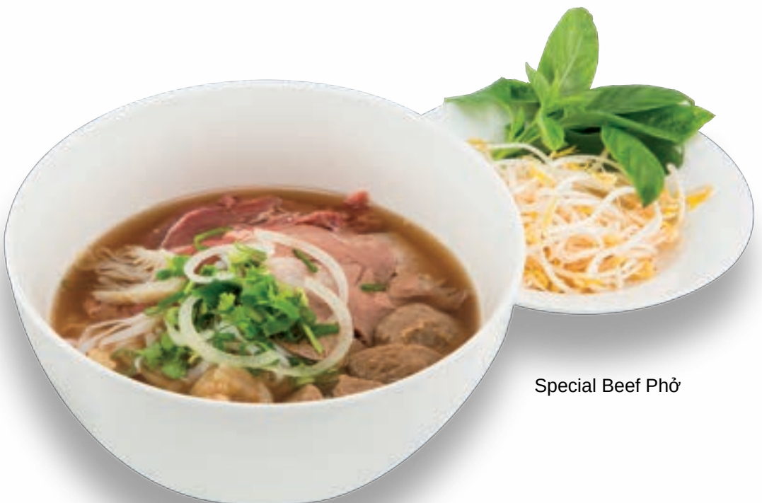
Special Beef Phở