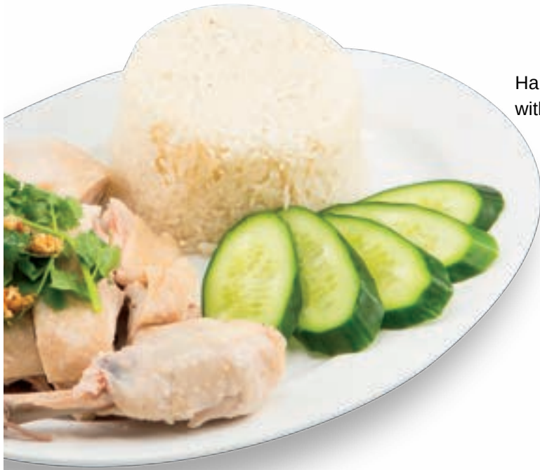
Hainam Chicken with White Rice